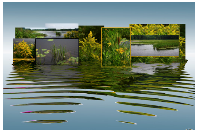
2-Jeane Kat McGrail Golden Opulence, from the The River Project: Origin, Movement, Confluence—Reflection Series 24" x 36" Digital Photo Assemblage 2011