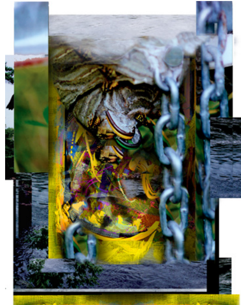
1-Jeane Kat McGrail Boat Wasps I, from The River Project Origin, Movement, Confluence—Convergence-Series 26" x 22" Digital Photo Assemblage ©2009