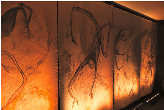
bert leveille -Nano Waves 1,2,3,4 installation view at Wabi Sabi Gallery, Twin Falls, Idaho each panel 8' x 4' (8' x 16') acrylic and silver paint on canvas with colored changing LED lighting ©2018